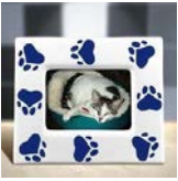
Pet Picture Frame/ any domesticated pet