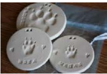
Paw Prints / any domesticated pet