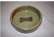
Pet Bowls / any domesticated pet