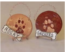
Pet Name Signs: Decorative Free Form / any domesticated pet