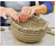
(I/A) ONLY Coiling

The sky is the limit with these intermediate & advanced clay classes! I/A Classes are simply Free Style classes , you can create whatever it is that you want out of clay within the class that you choose! These classes are more advanced and include VERY LITTLE instruction. I/A Students are experienced Country Home Learning & Art Center Students, Clay hobbyists, or Professional Potters age's 16-adult who have taken several clay classes already and knows the system. I/ A Classes must be scheduled like a regular lesson. they are not open studio classes!